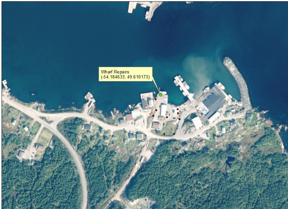
Repairs to an Existing Wharf in Seldom Harbour, Fogo Island