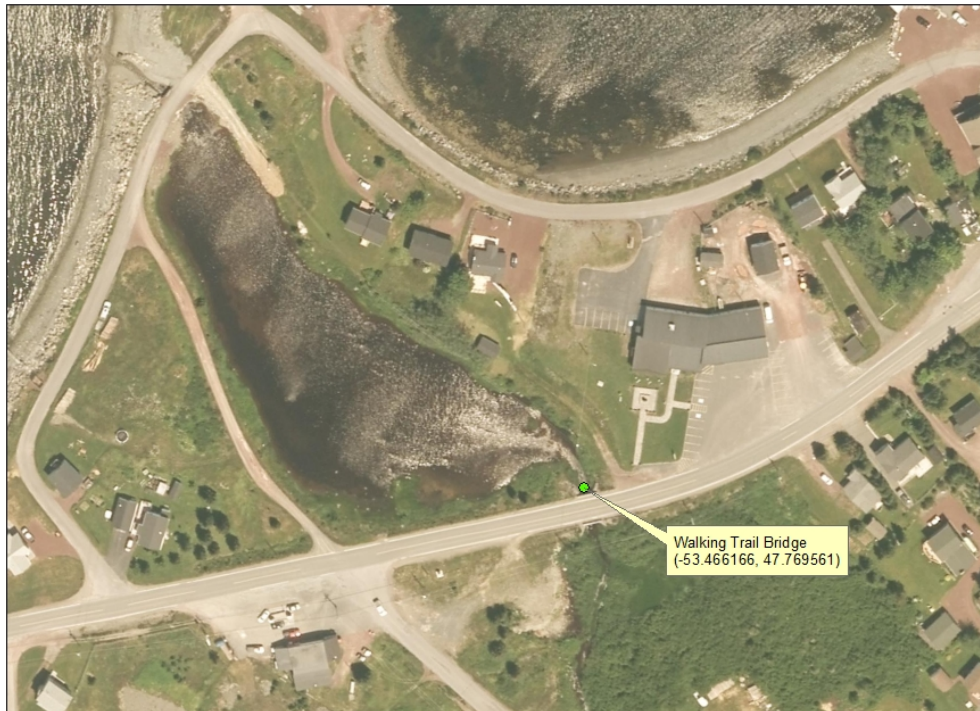
Heart's Delight - Islington Walking Trail