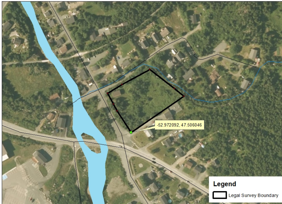
Residential Development near Country Path Road, Conception Bay South