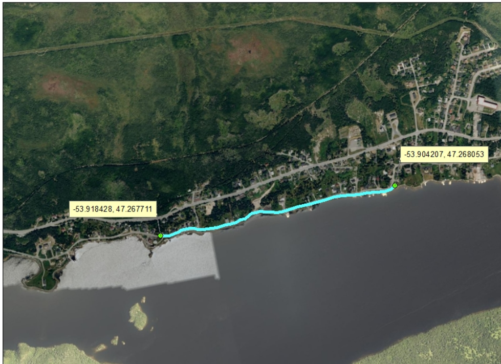
Shoreline Protection and Walkway in the Town of Placentia