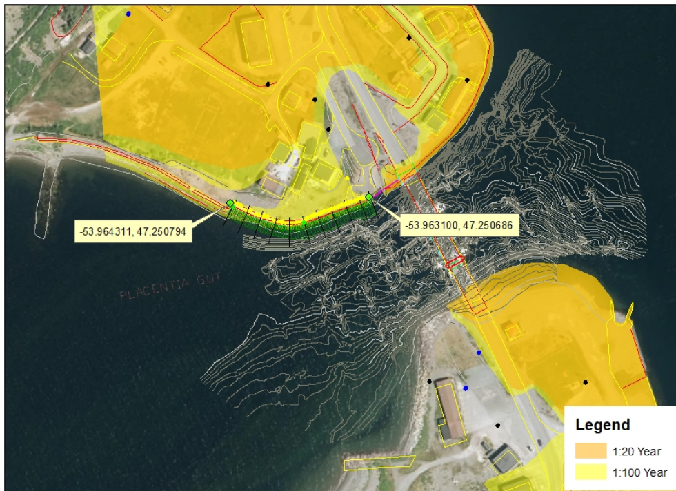
Shoreline Repairs in the Town of Placentia