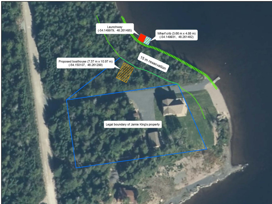
Construction of Boathouse, Wharf and Launchway at Jamie King's Property in Thorburn Lake