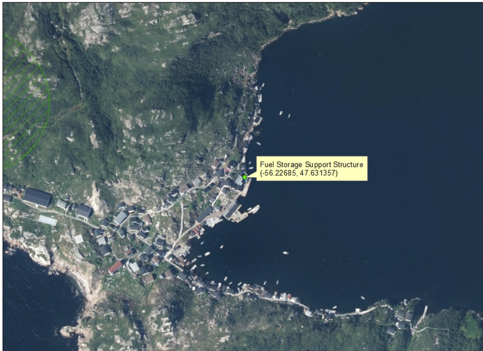
Fuel Storage Support Structure Improvements in McCallum