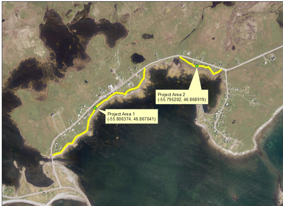
Shoreline Rehabilitation in the Town of Lamaline