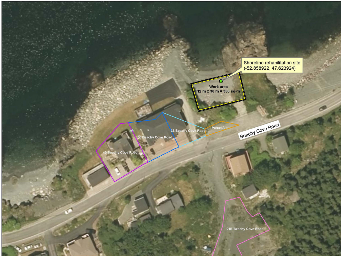
Shoreline re-habilitation work at 24-38 Beachy Cove Road, Portugal Cove-St. Philip's