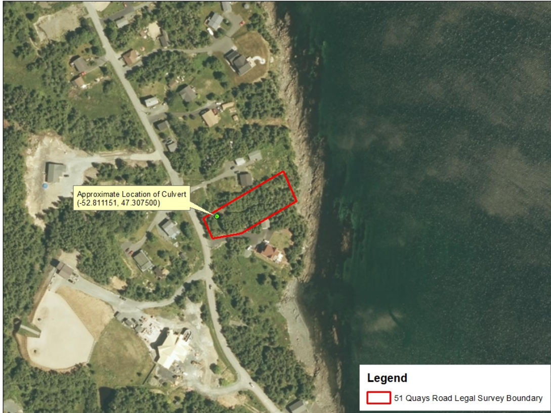
Driveway Culvert a 51 Quays Road, Bay Bulls