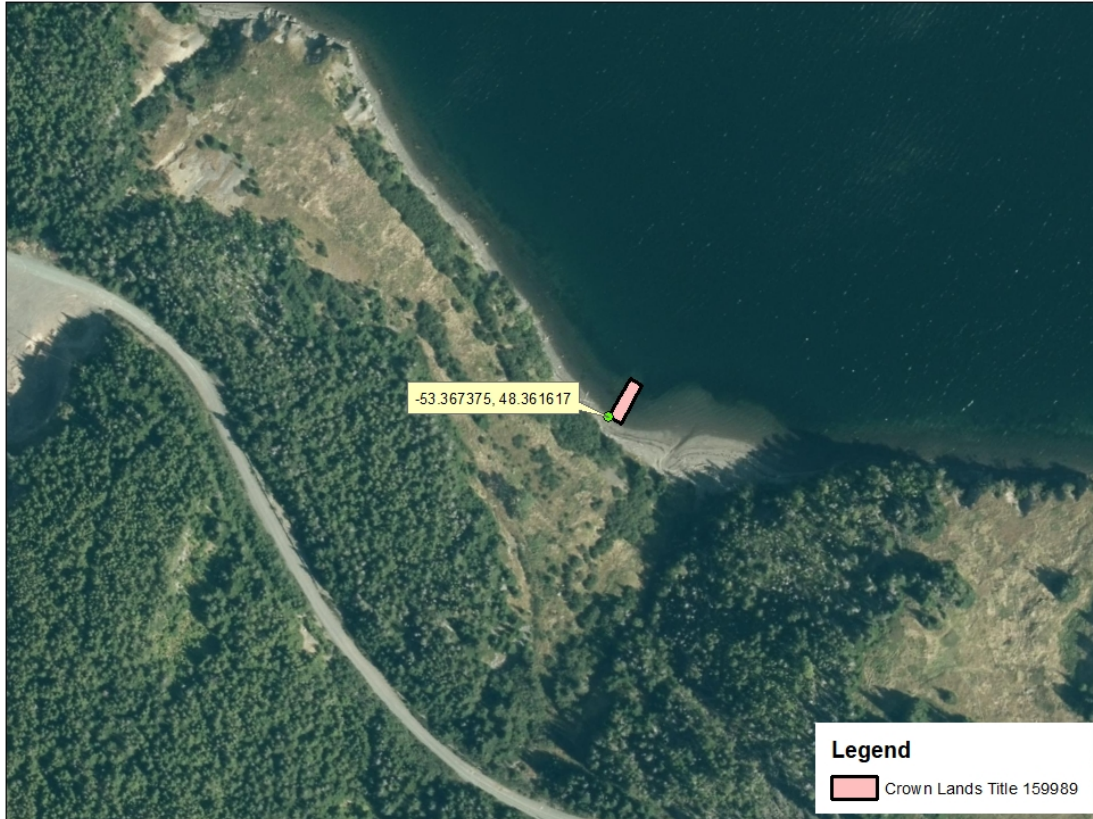
Wharf at 35 Fort Point Road, Trinity