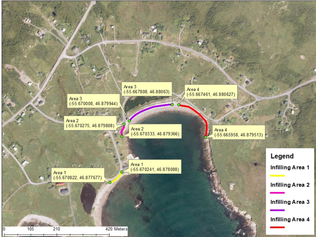
Shoreline Repairs in the Town of Lord's Cove