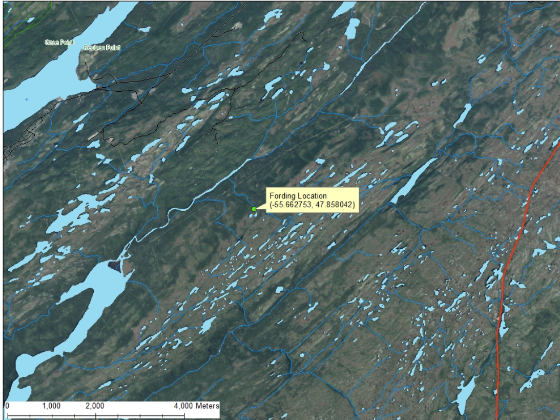
Golden Baie Property Fording