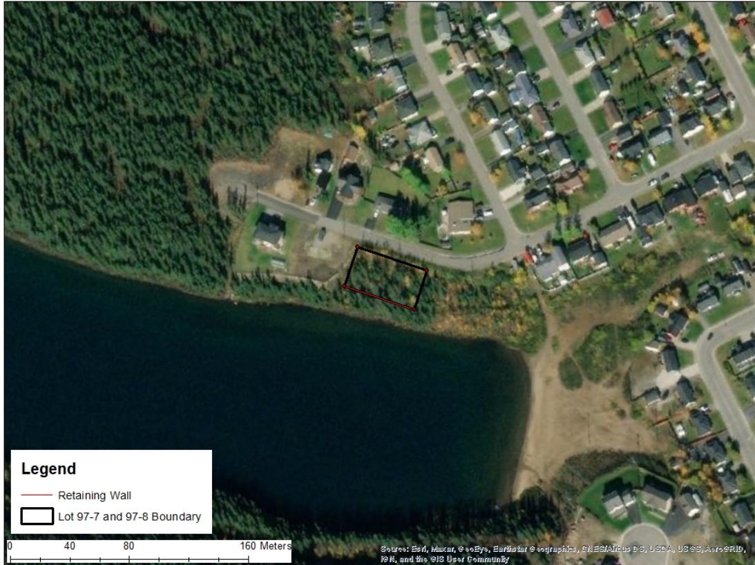
Retaining Wall along Lot No. 97-7 and Lot No. 97-8 in Labrador City