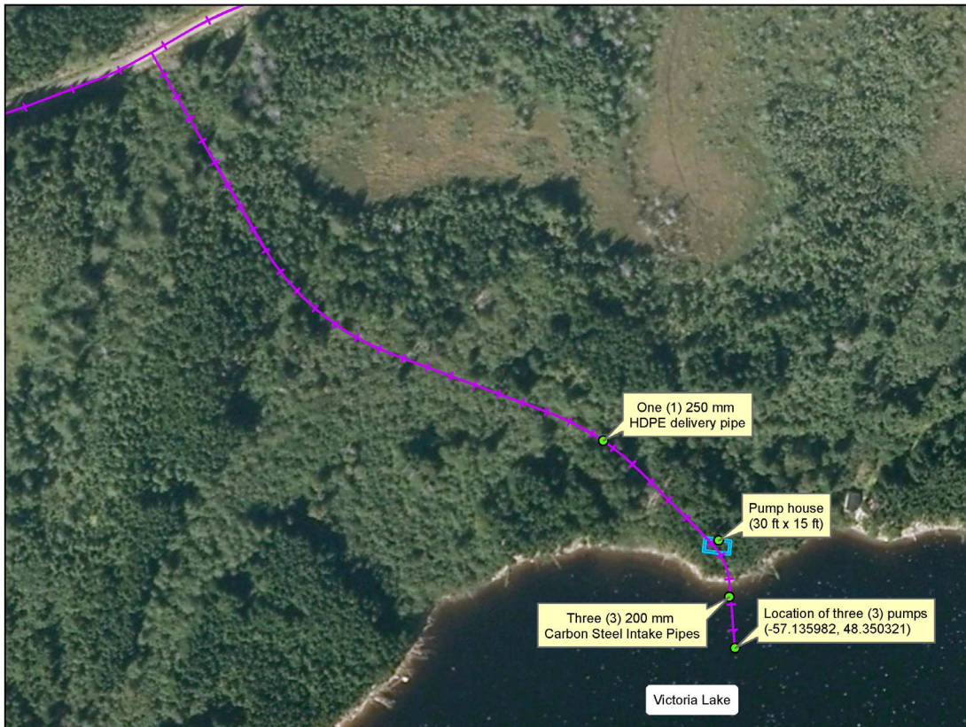
Installation of Water Intake Pumps at Victoria Lake in Valentine Gold Project Site