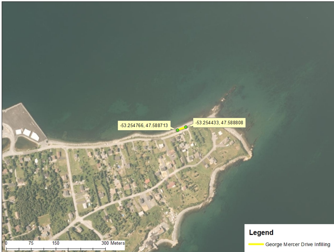
Armour Stone Placement George Mercer Drive, Town of Bay Roberts