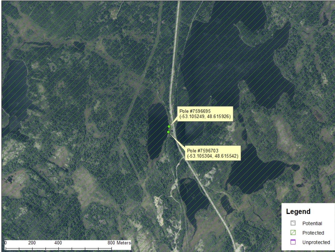
Replacement of Deteroraited Poles in the Town of Bonavista