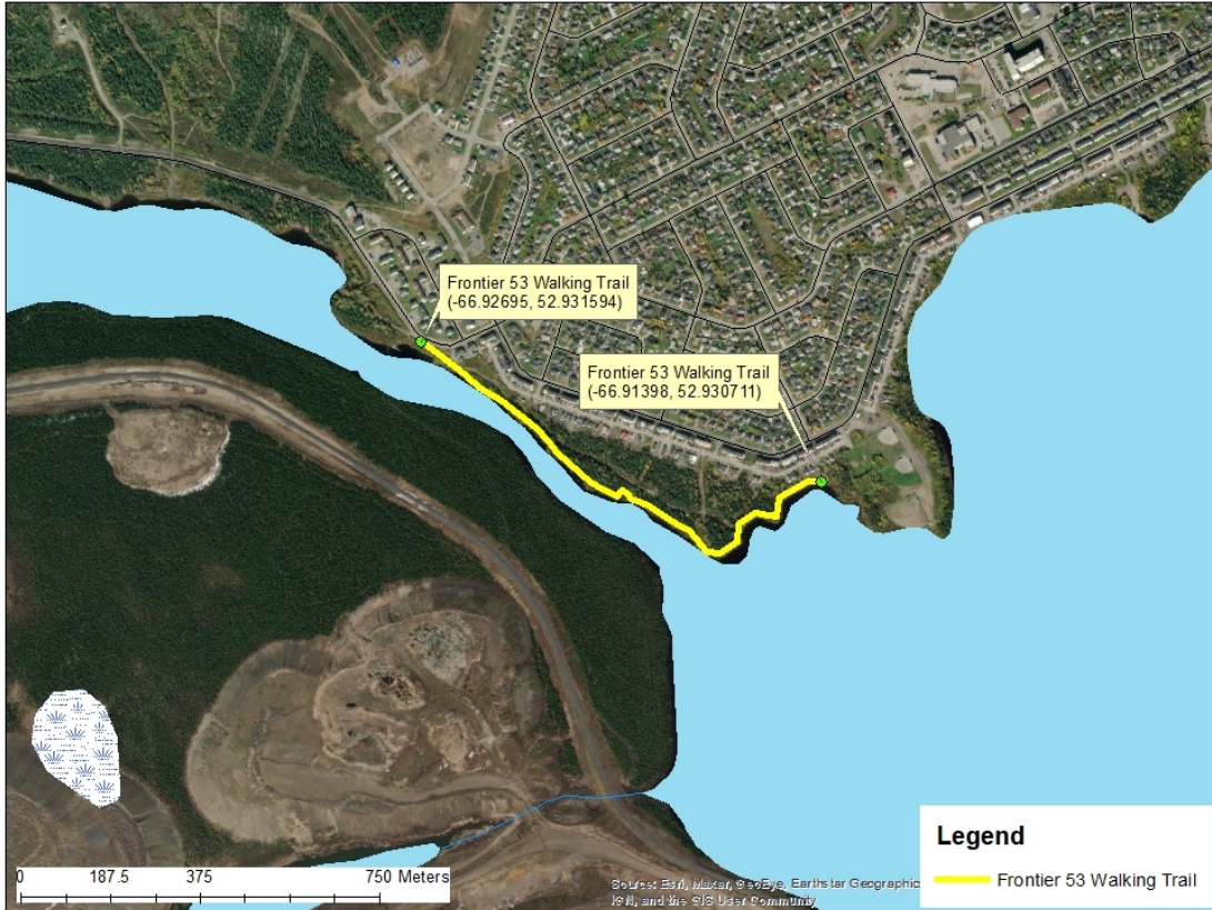
Extension of Waterfront Walking Trail in Labrador City