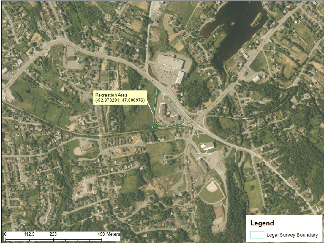
Construction of a Recreation Area near 353-371 Conception Bay Highway, Conception Bay South