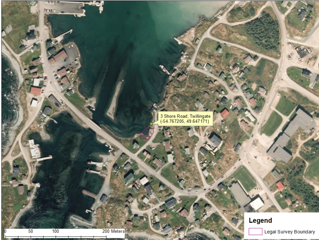
Infilling at 3 Shore Road, Twillingate