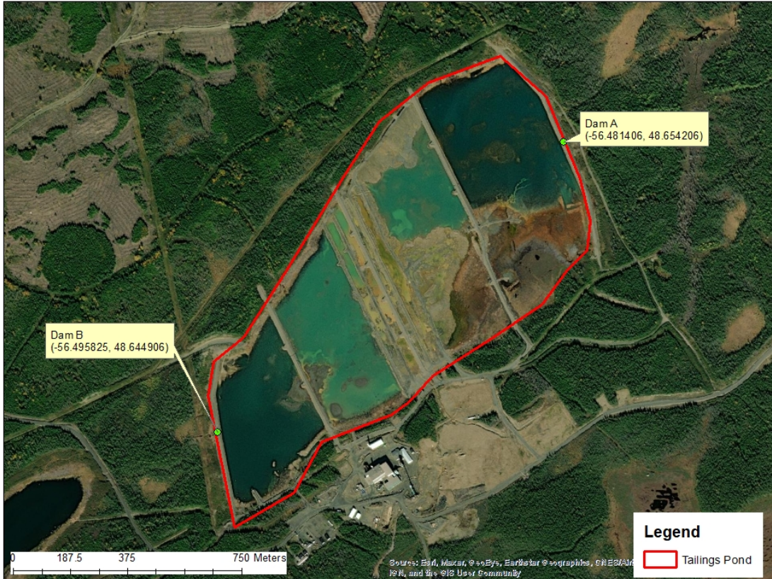
Dredging of Tailings Pond