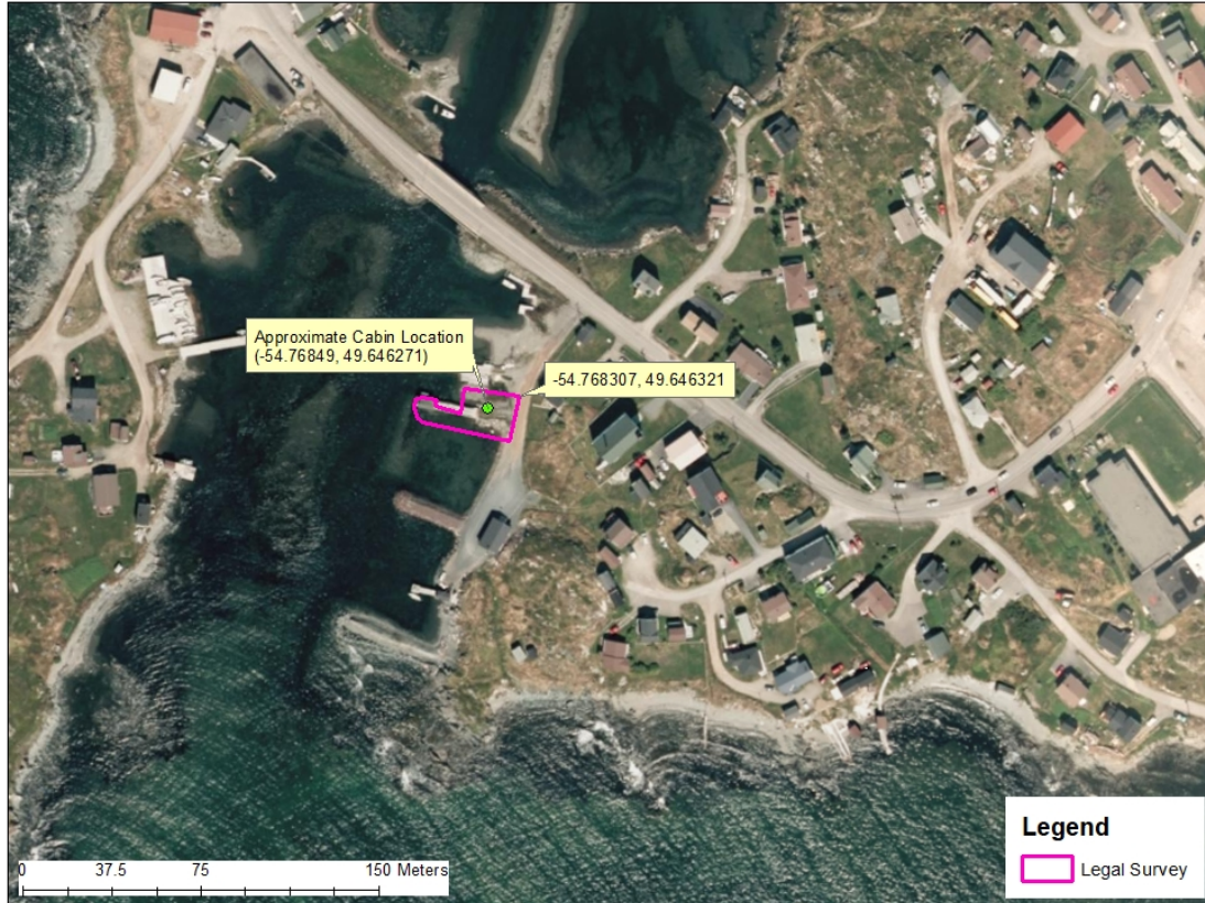
Construction of a Cottage at 117 Main Street, Twillingate