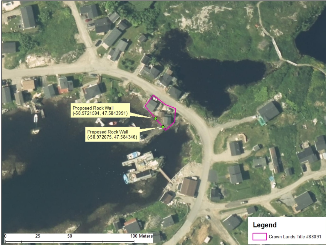
Rock Wall Construction at 31A Water Street, Isle aux Morts