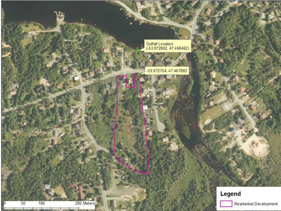
Seal Cove Pond Residential Outfall