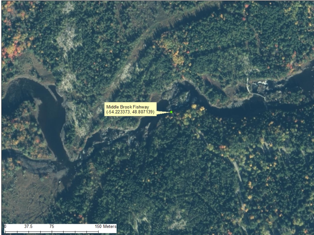
Fishway Refurbishment in Middle Brook, Town of Gambo