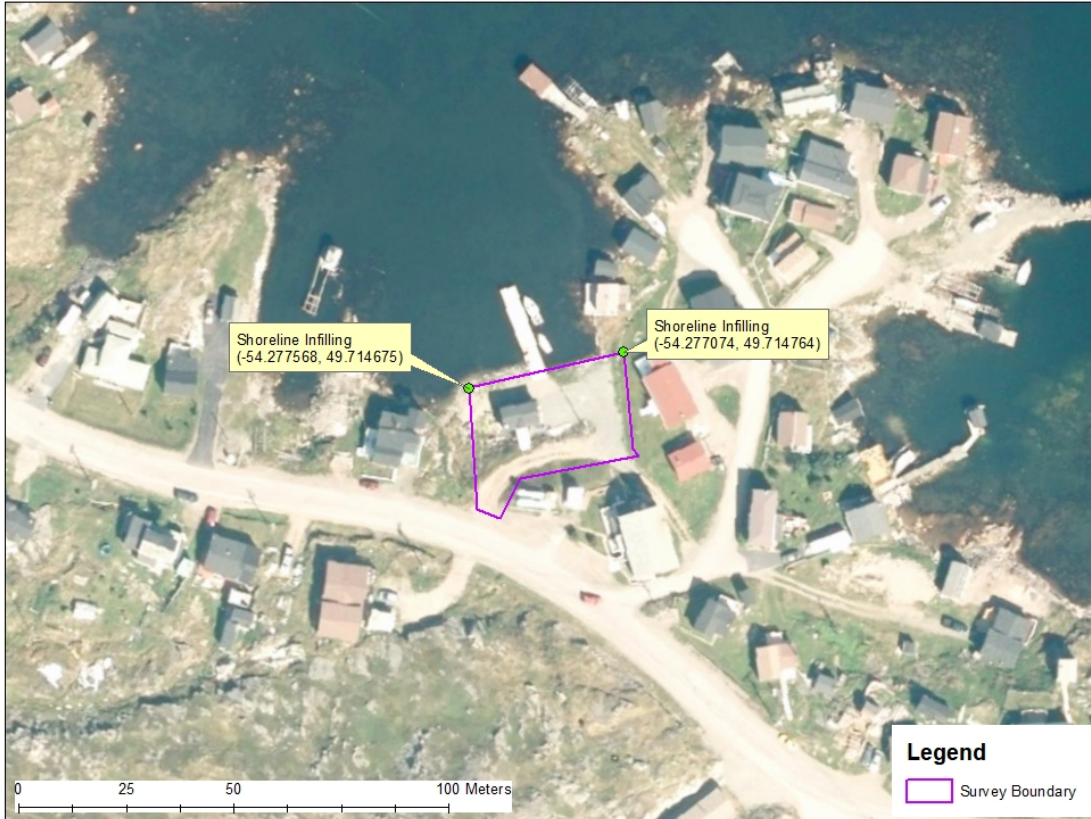
Erosion Protection at 63A Main Street, Fogo Island