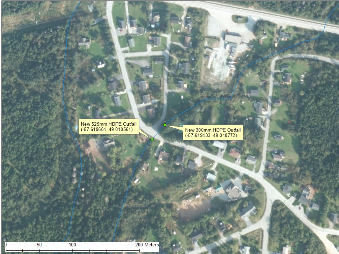
Storm Sewer Installation at Forest Road, Town of Pasadena