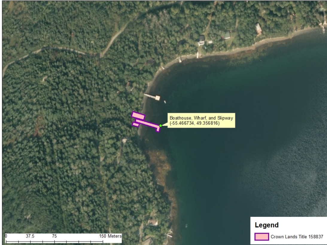
Boathouse, Wharf and Slipway Construction in Cooks Cove