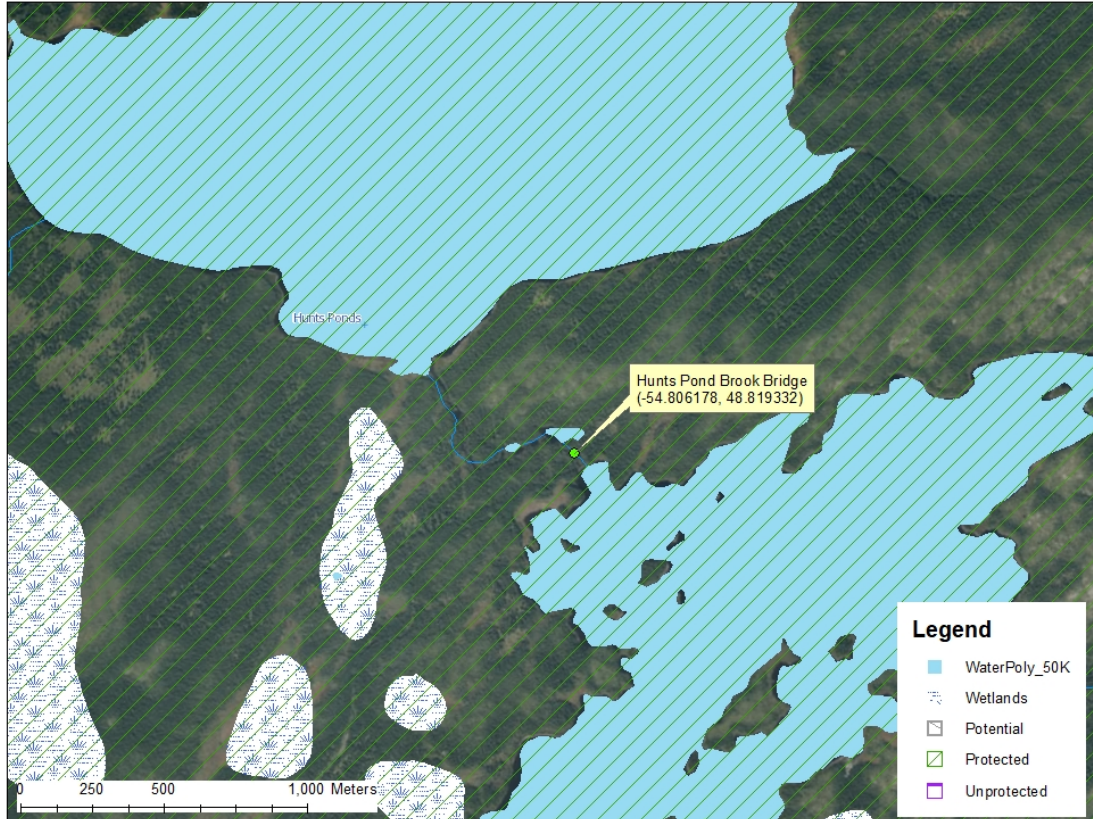
C-166i Hunts Pond Resource Road Bridge