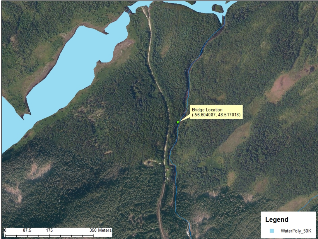
Haven Steady Resource Road (W-191a) Bridge