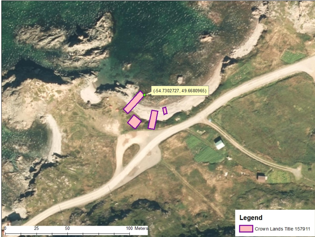
Construction of a Boathouse, Wharf and Slipway in the Town of Twillingate