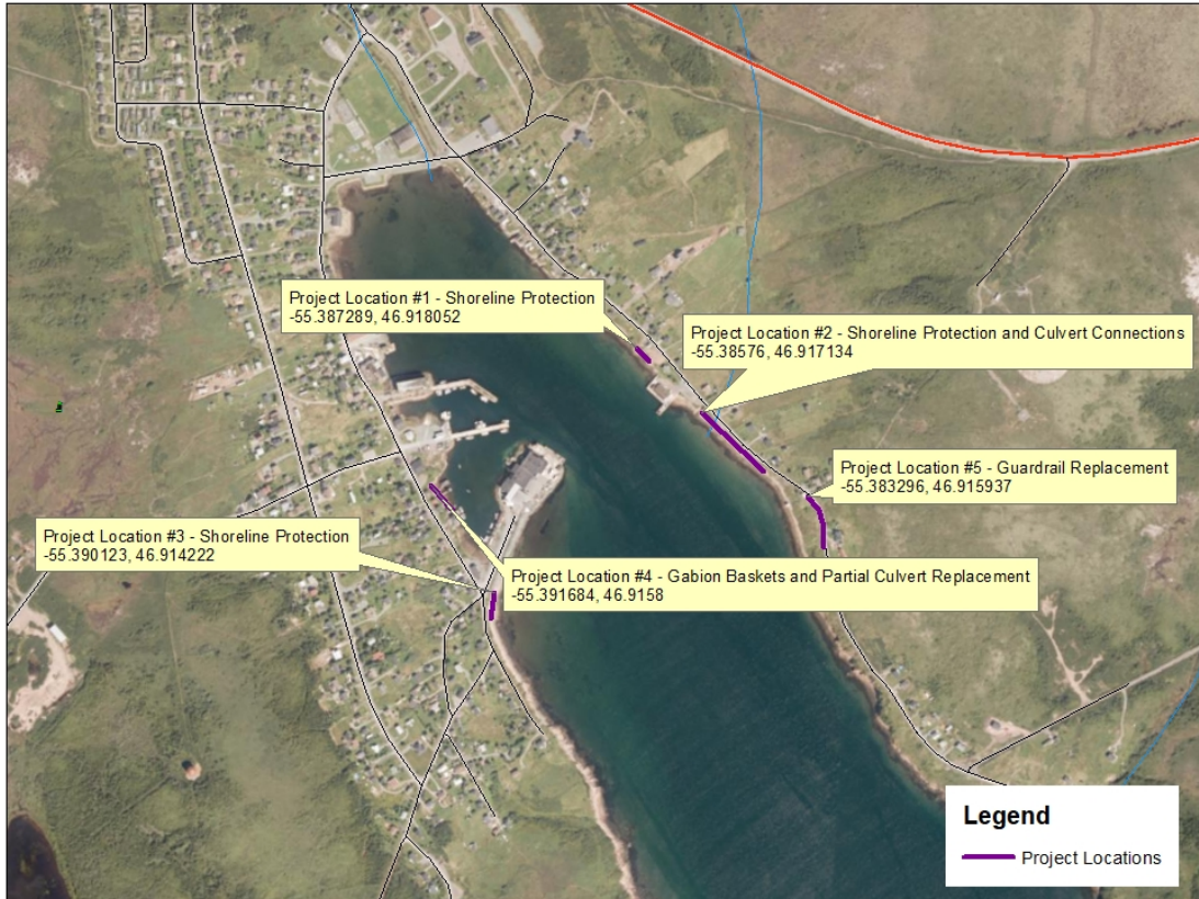
Hurricane Larry Storm Damage Repairs, St. Lawrence, NL