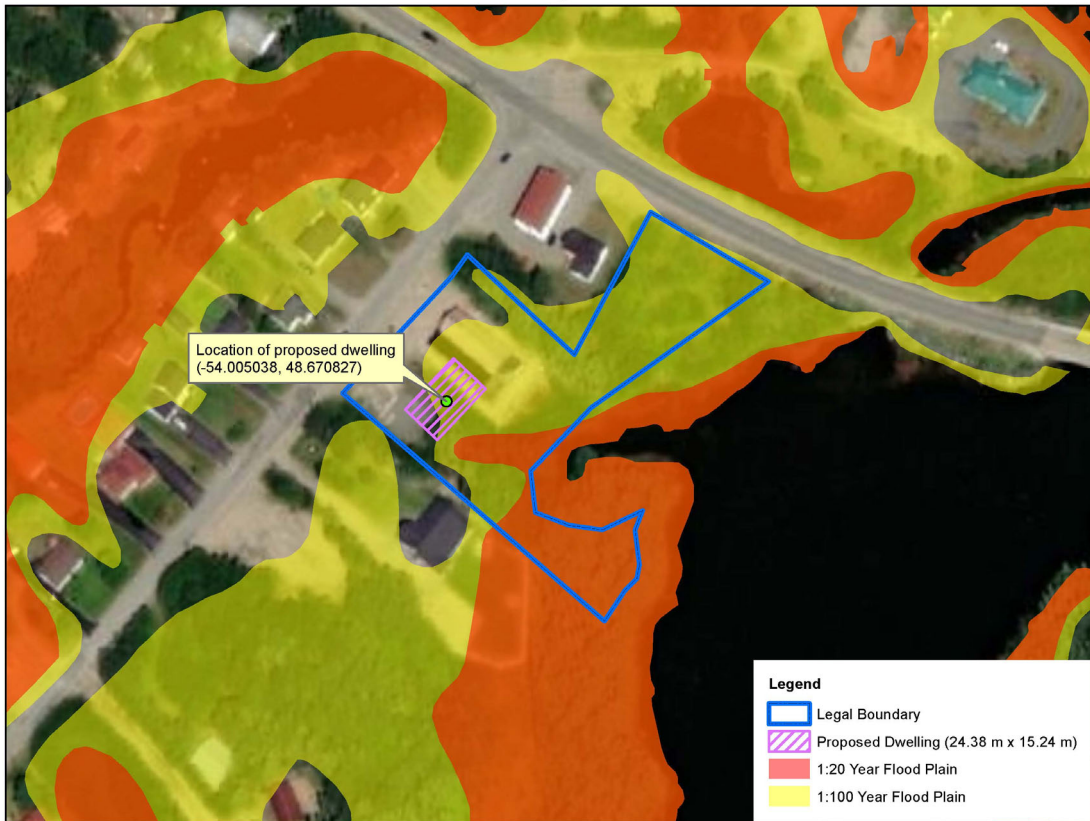
House Construction at 3-5 Angle Brook Road, Glovertown