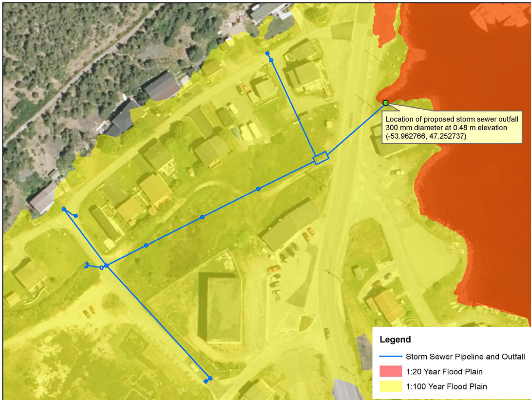
Town of Placentia Flood Plain Mapping