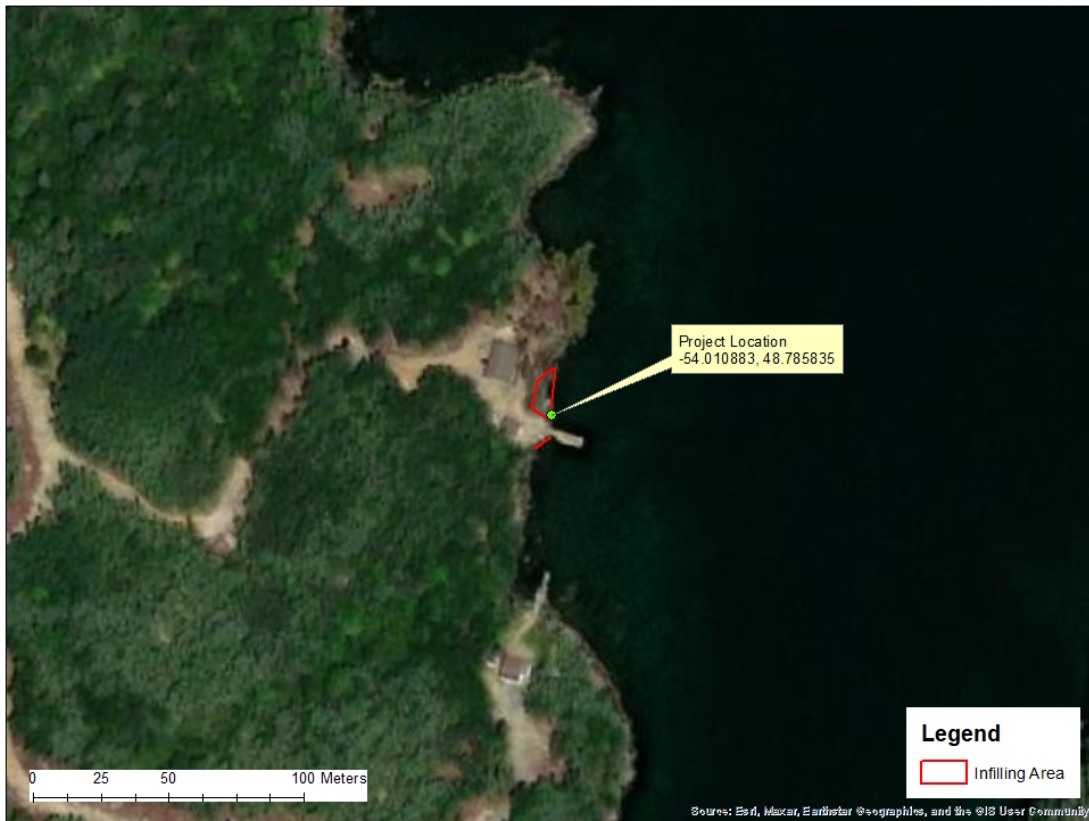
Cat Gut - Erosion Protection