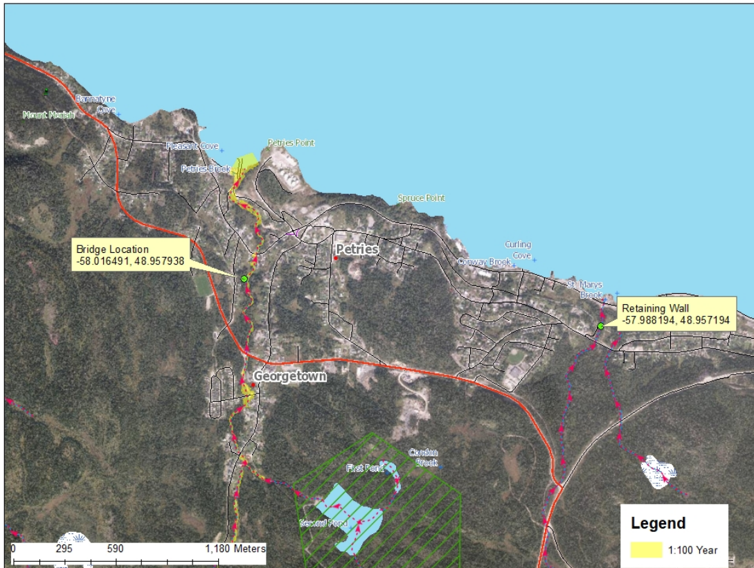
Corner Brook - Great Trail Enhancement Project Phase 1 - Pedestrian Bridge and Retaining Wall