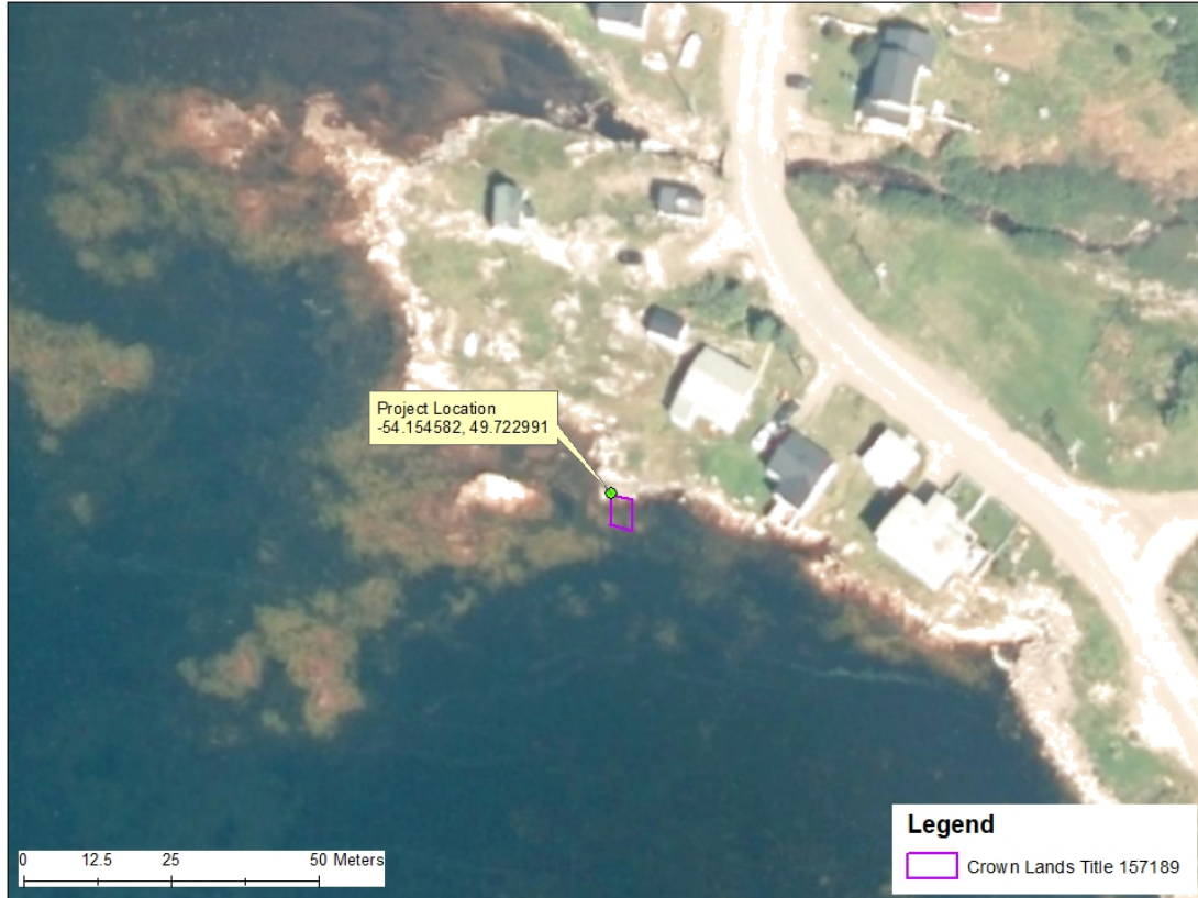
Fogo Island (Joe Batt's Arm) - Boathouse and Wharf Construction