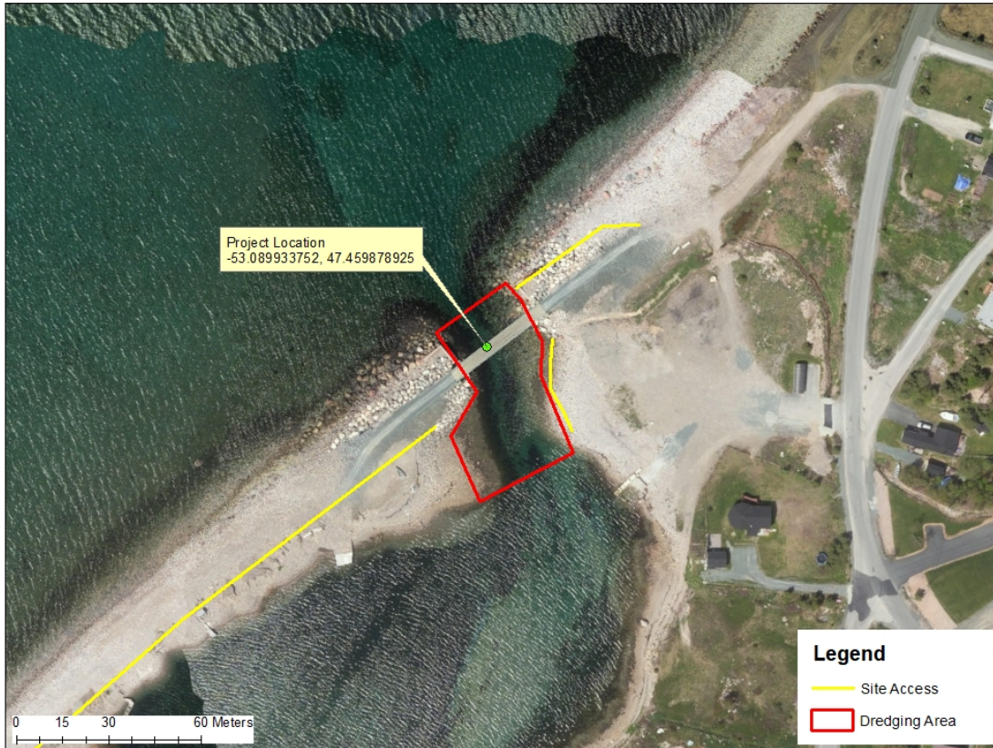
Dredging - Conception Bay South (Indian Pond)