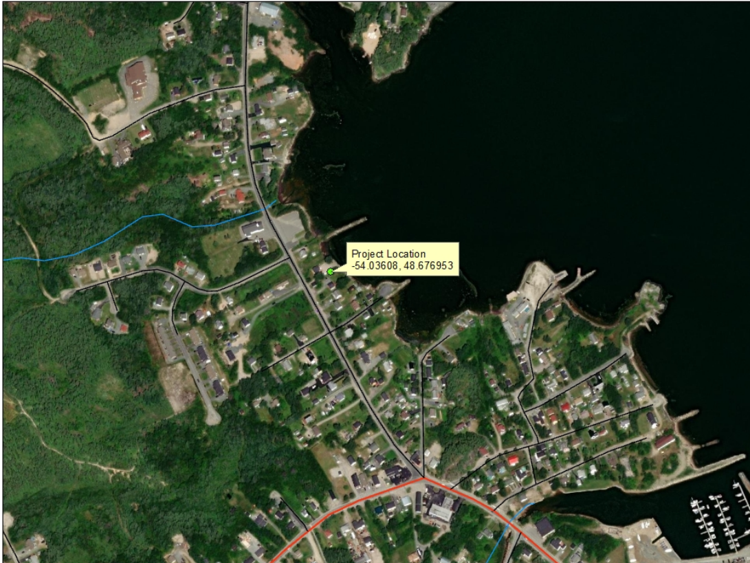
36 Main Street North - Boathouse Construction