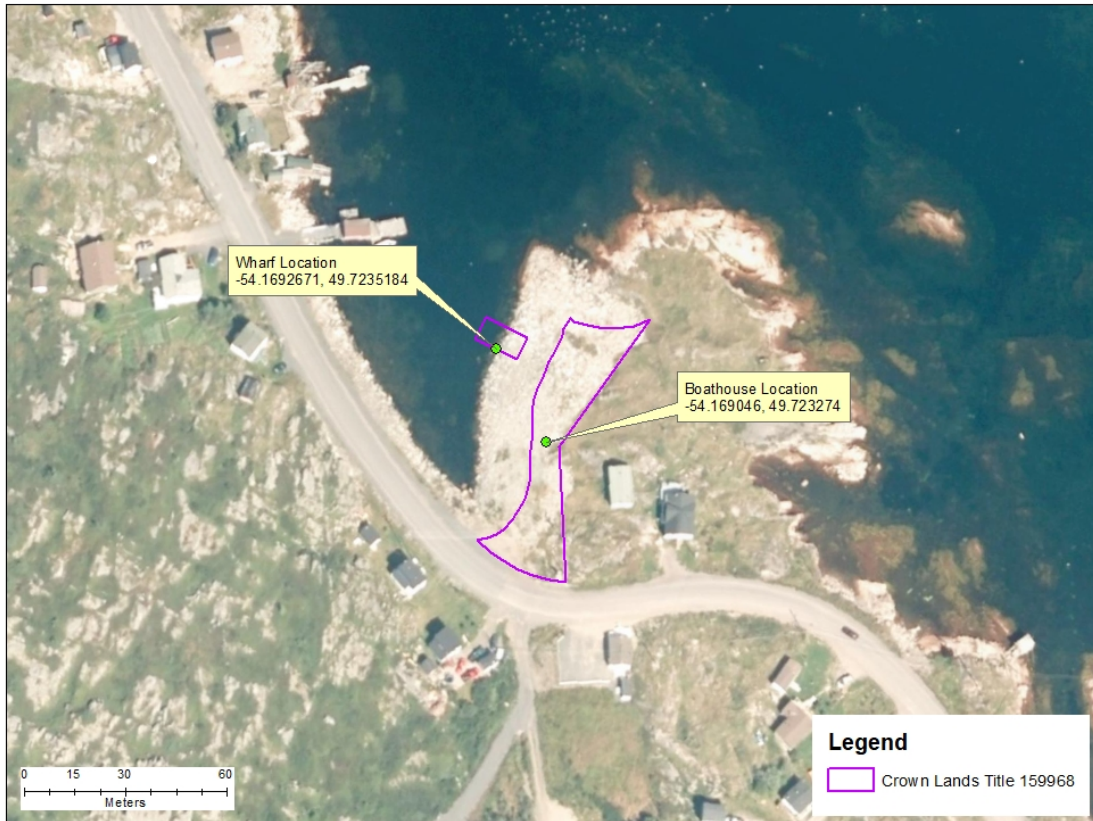
Town of Fogo Island (Joe Batt's Arm) - Boathouse and Wharf Construction