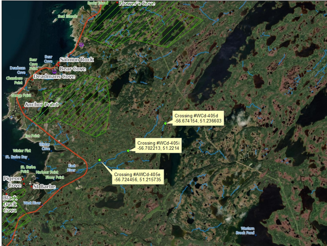
Labrador-Island-Link Access Improvements - Culvert Locations