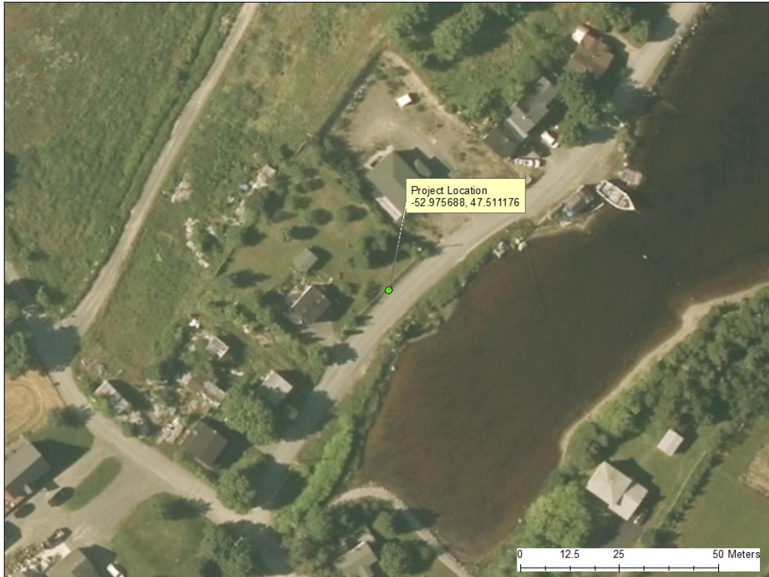
Town of Conception Bay South - 7 Patty's Arm Road Water & Wastewater Services