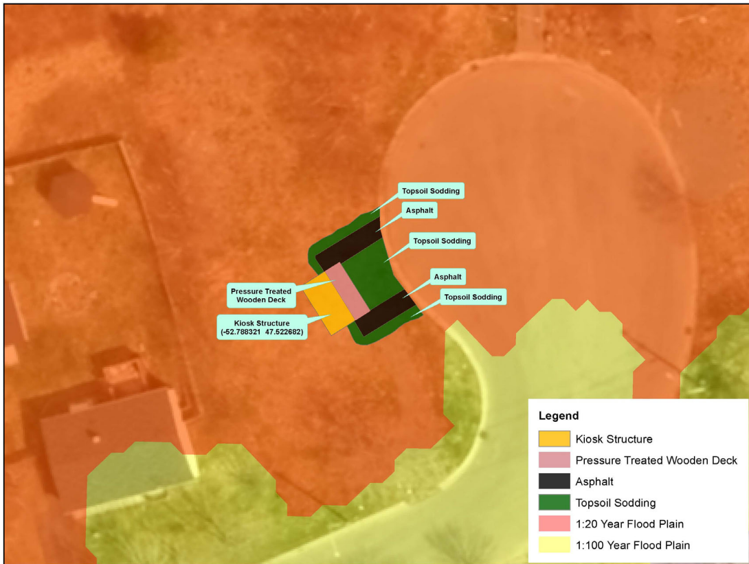
Temporary Mobile Kiosk at 29 Forest Avenue, Mount Pearl