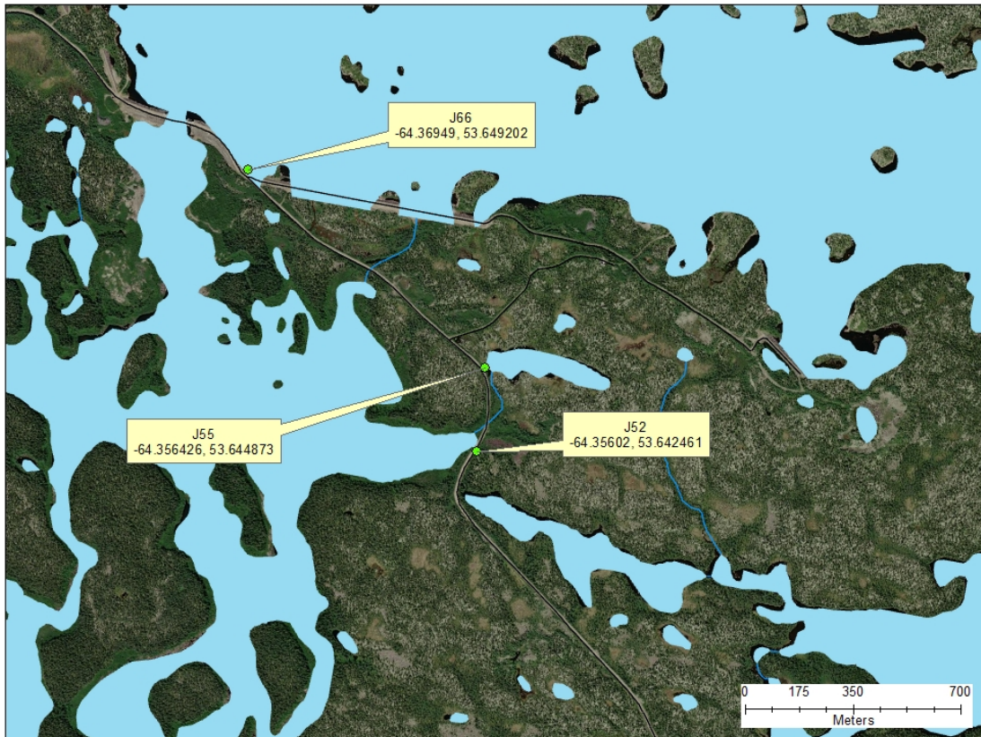
Western Labrador - L601 Pole Reroute & Infilling