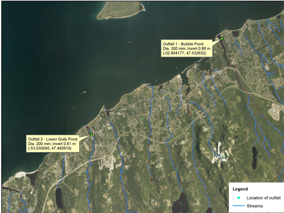
Installation of Stormwater Outfalls in Conception Bay South