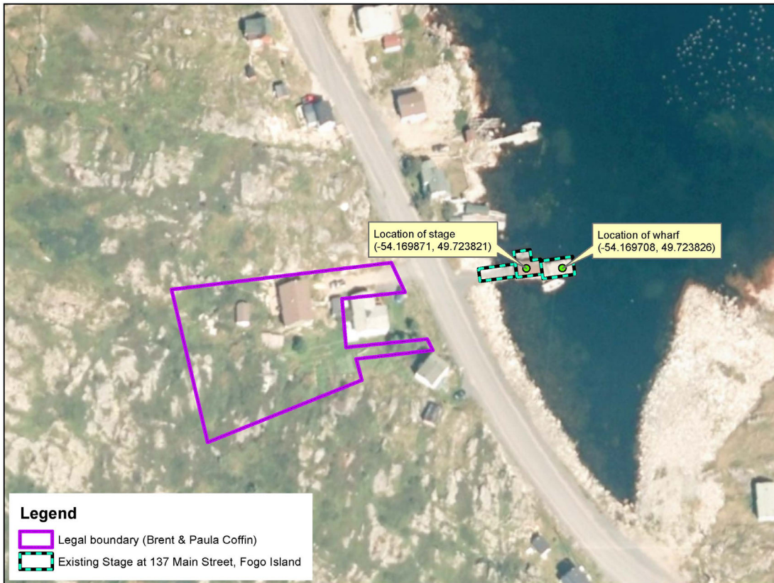
Stage Repair at 137 Main Street, Fogo Island