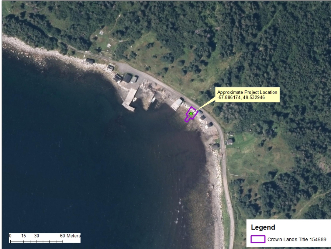
Town of Norris Point (Wild Cove) - Boathouse and Wharf Construction