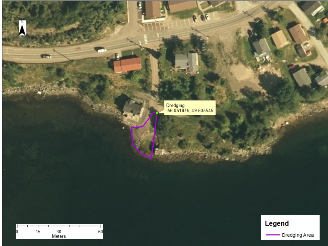
Fuel Spill Remediation - Spruce Street, Springdale, NL