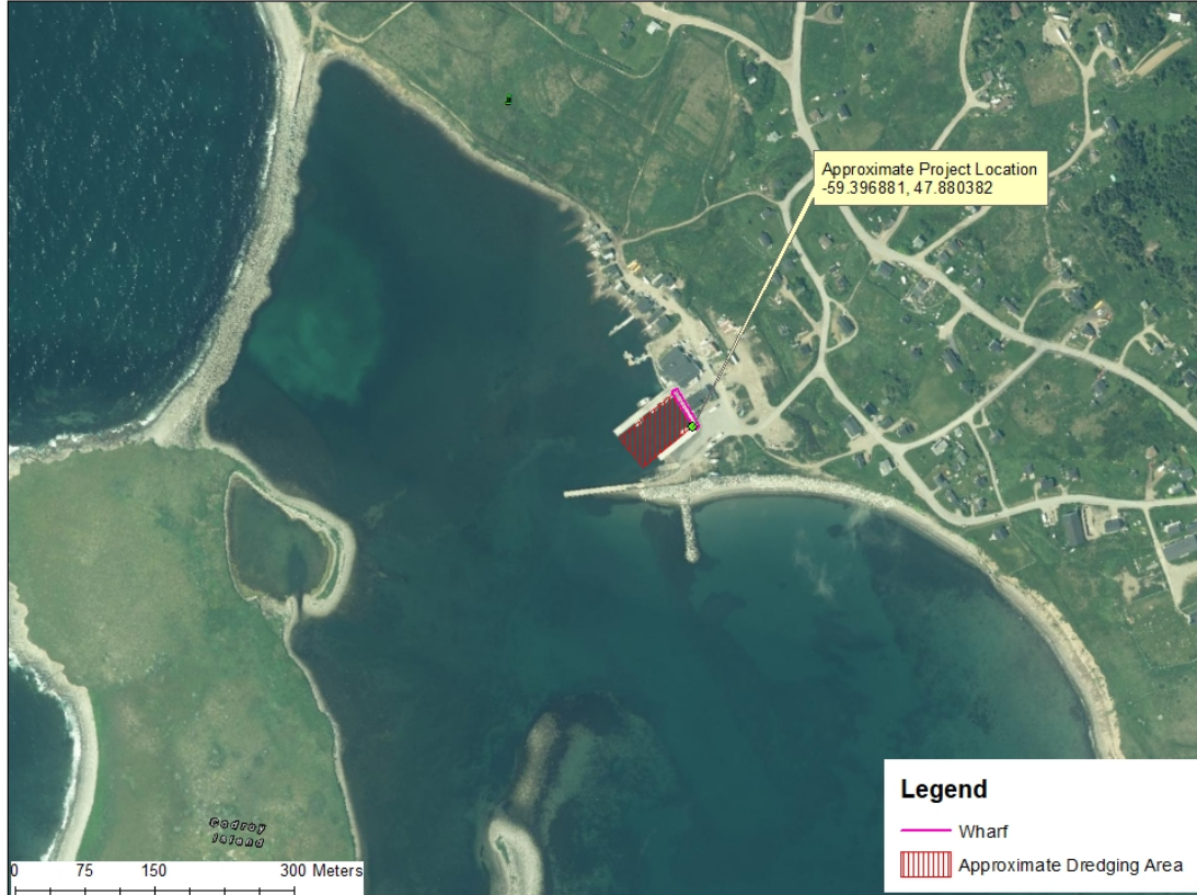
Codroy (Codroy Harbour) - Fisheries and Oceans Canada's Small Craft Harbours - Wharf Reconstruction & Dredging