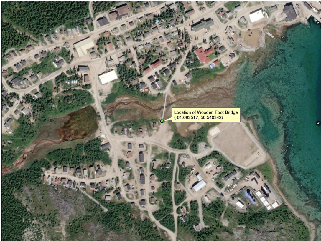
Replacement of an existing Wooden Foot Bridge across Nain Brook in Nain